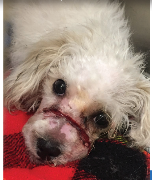
Pandora just hours after surgery

Within a day's time, Pandora was alert and full of joy. She faced her recovery with enthusiasm as her wounds healed and her spirit lifted. She soon realized that she was free of the torture that had plagued her puppyhood. During her stay here, Pandora was often found playing with toys and excitedly carrying them around in her mouth, a simple joy that had been previously taken away from her. She loved everyone she met and quickly became a favorite among staff and volunteers. Even after all that she had endured, Pandora's spirit was unbroken.